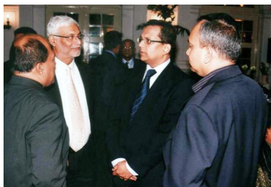
Fellowship at the conference dinner