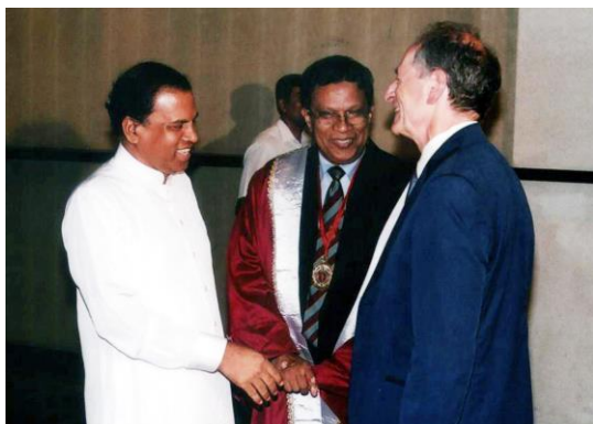
Welcoming the Chief Guest and the Guest of Honour