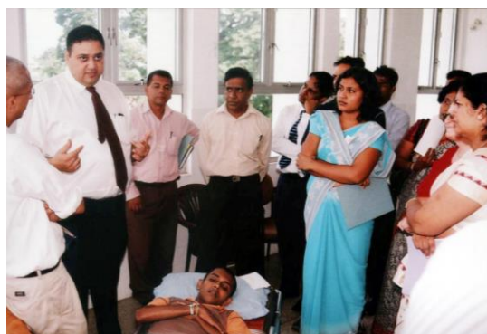
Post congress session on Rehabilitation