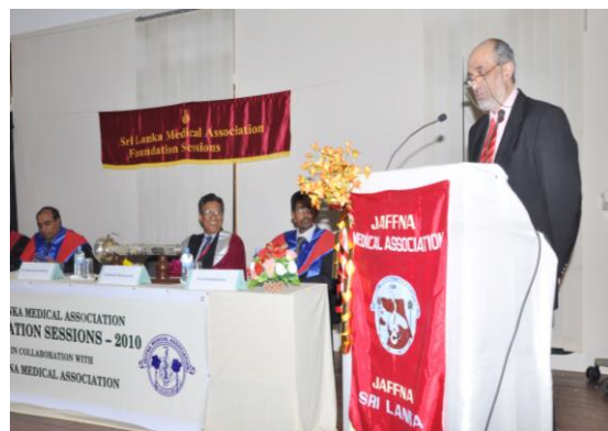
Address by the Chief Guest