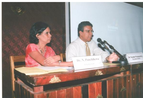
The President/SLMA addressing the gathering Seminar on “Dengue Hemorrhagic Fever”

15 th August 2010, at 8.30 a.m. at the Lionel Memorial Auditorium