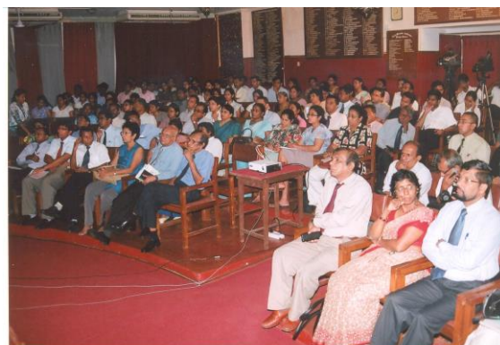
A section of the crowd