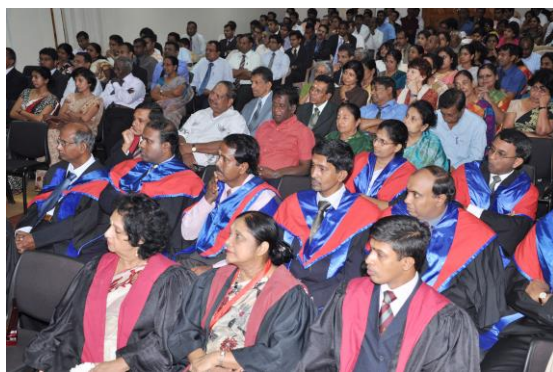
The distinguished gathering