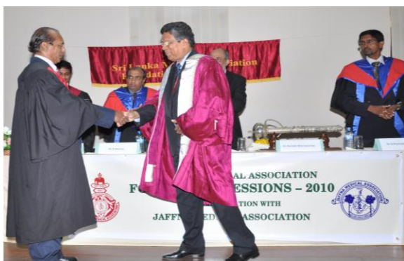
Award of Honorary Life Membership