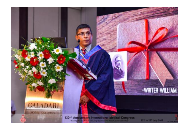
Vote of thanks by Hony Secretary SLMA