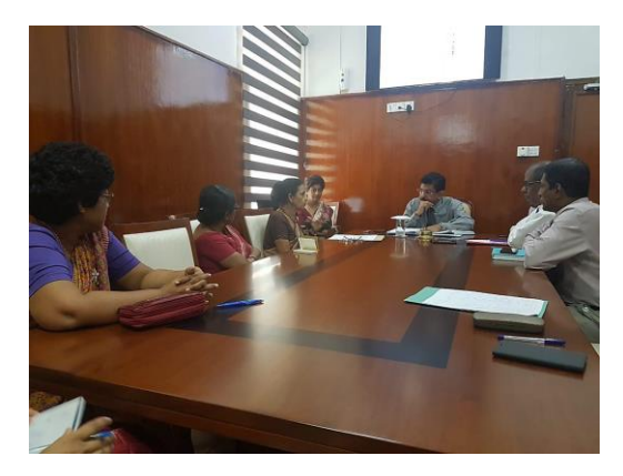
Meeting with the Hon. Minister of Health