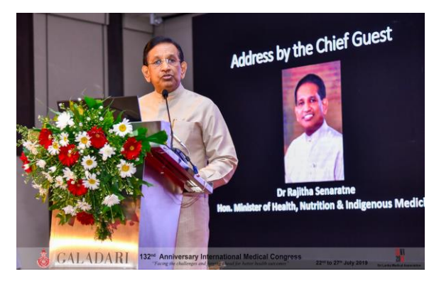
Address by Chief Guest