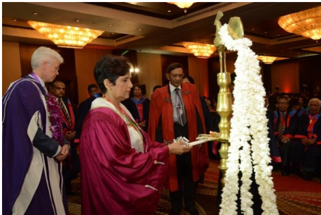
Lighting of the oil lamp