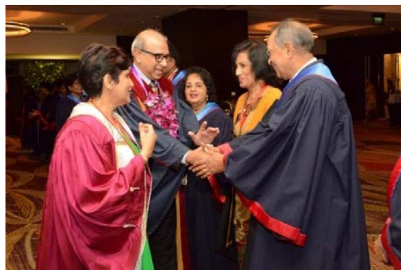
Introducing the Past Presidents to the chief guest