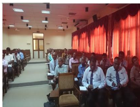
Participants at the Discussion Forum on Water Pollution in Jaffna