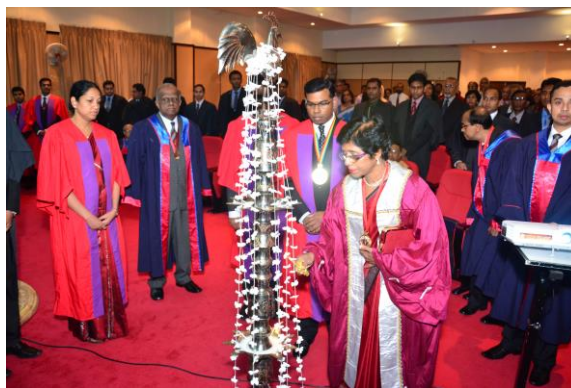
Lighting of the oil lamp